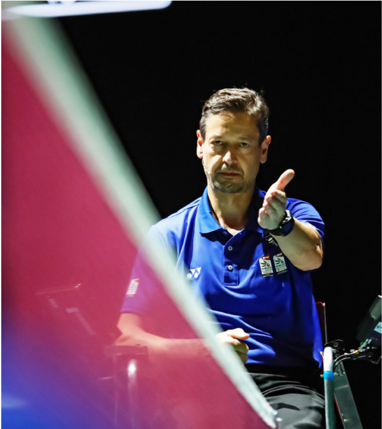
Table 8.1. Umpire Guidelines for Use of Social Media